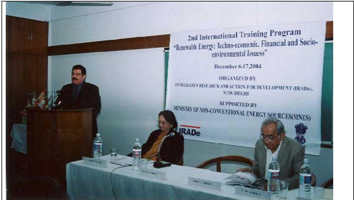
Mr Rakesh Bakshi CEO of Vestas RRB speaking at the inauguration session of the 2 nd International Training Programme

predominant source of energy. We are planning to foray into building wind and biomass hybrids. Both can supplement each other and it is just the question of marrying the two, Vestas RRB has proposed to generate an additional 100 MW of power before March 31, 2005 by setting up wind farms in Tamil Nadu and Karnataka., it is also planning to invest Rs 35 crore by next next year for building a robust equipment which can engineer perfection locally in a cost effective manner.