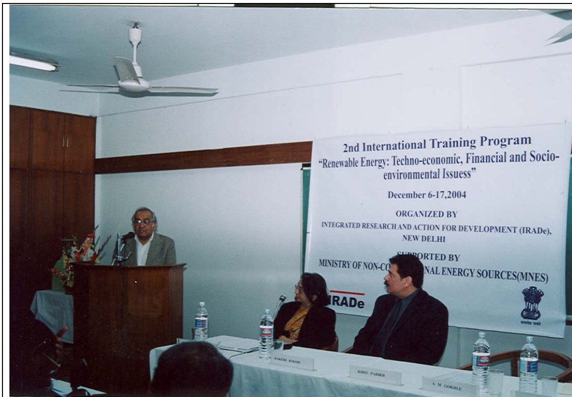
Professor Kirit Parikh: Inaugurating the 2 nd International Training programme

He mentioned the importance of renewable energy sources, more so in the present scenario of energy demand. He stressed upon the issues related to energy security of a developing nation as a backbone of a growing economy. The energy security is a matter of concern in the present context of geopolitical and technological development. He also highlighted the various areas of the non-conventional energy sources which are yet to be tapped of are in the pilot stage such as geothermal energy, tidal energy and Hydrogen energy. He gave an overview of the renewable energy processes i.e. material, process, product, energy conservation and available energy in the form of electricity. He also mentioned the importance of such type of international training programmes where experiences of both success and failures can be mutually shared.