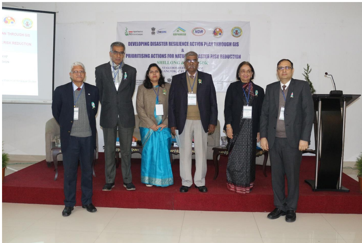
1 Delegates on the dais in the Inaugural Session