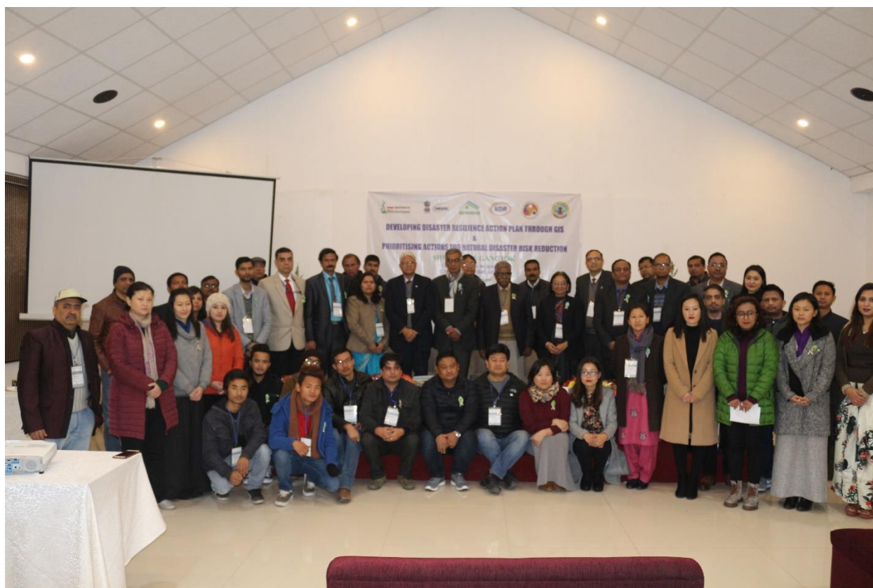
2 Group photograph of participants of the workshop