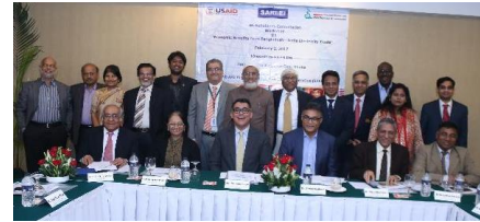
Dhaka, February 2, 2017

Visit to Bangladesh to collect data, presenting the study objectives to stakeholders and discussing scenarios