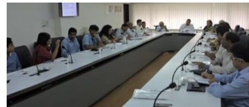
New Delhi, Aug 31, 2017

To present and discuss the study, approach, scenarios and draft outcomes; validation of parameters and results