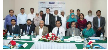
Dhaka, May 17, 2017